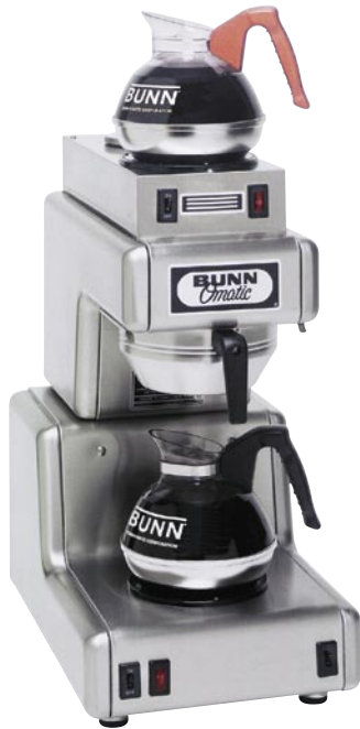
Model OL (2 warmers)